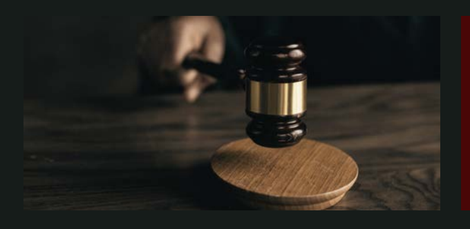
The team will represent QUB at the national finals, taking place on 10th February at the Summit weekend, Royal Marine Hotel.